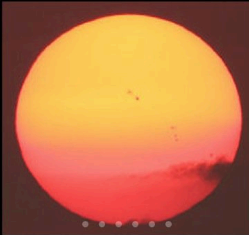
Big sunspots at sunset.

STORM WARNING: A cloud of plasma hurled toward Earth by sunspot 1261 is expected to arrive on Aug. 5th, possibly triggering polar geomagnetic storms.