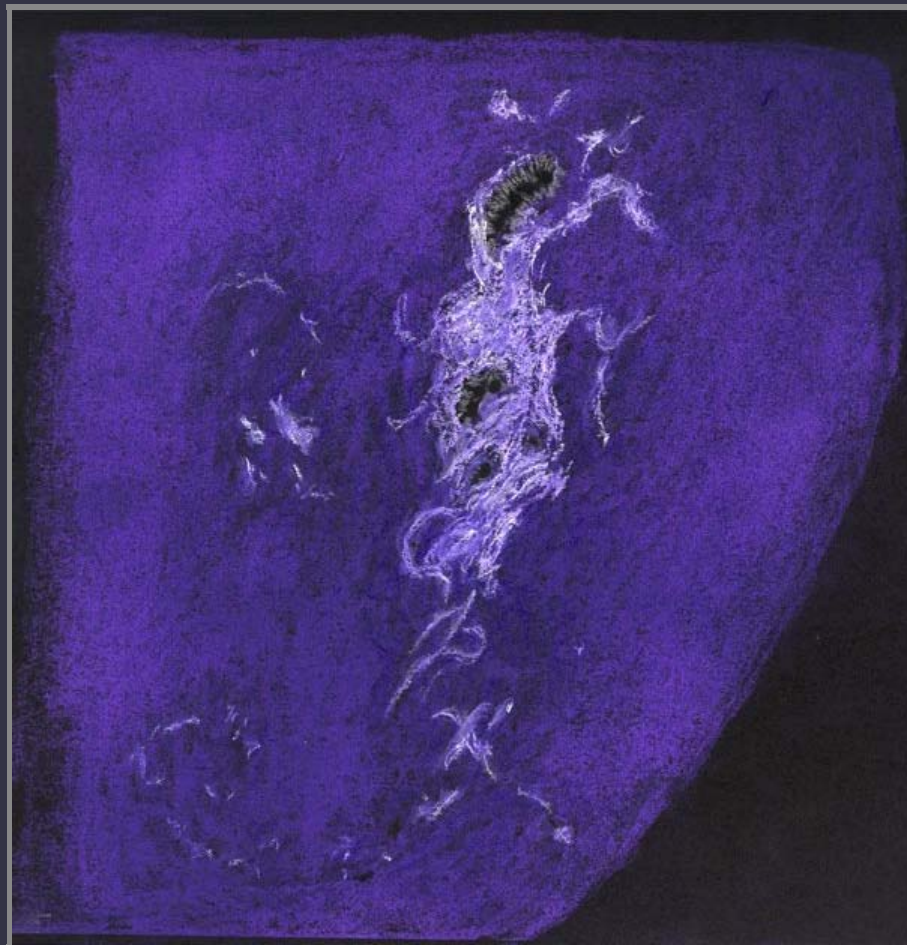
CaK AR11040 - January 14, 2010

Posted on 01-19-2010 under Sun , white light , sunspots , CaK Filtered